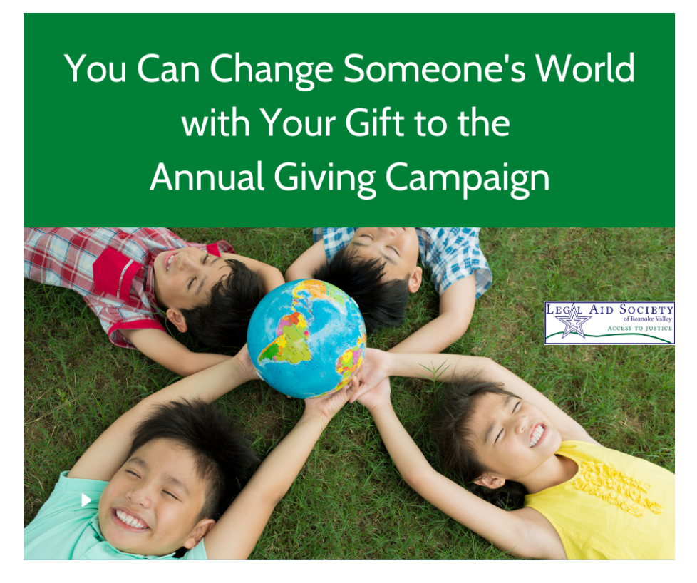
The Legal Aid Society of Roanoke Valley's Annual Giving Campaign