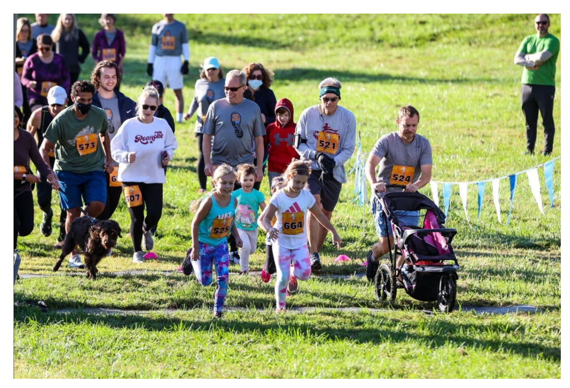
The Roanoke Valley Paralegal Association will host the second annual "Jaunt for Justice 5K," a 5K Run/Walk to benefit The Legal Aid Society of